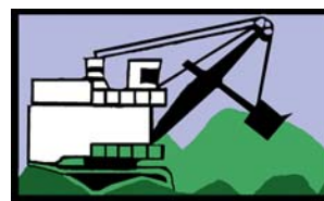
SMART Surface Mining Association for Research and Technology

AngloGold Ashanti (Colorado) Anglo American Metallurgical Coal ArcelorMittal Mines Canada Barrick Gold Corporation BHP Billiton Diamonds Inc. BHP BMA Coal Australia Canadian Natural Resources Ltd. Cliffs Natural Resources DeBeers Canada Inc. Foundation Coal West Inc. Freeport McMoran Copper & Gold Graham Group Ltd. Goldcorp Canada Ltd. Imperial Oil Ltd. Iron Ore Co. of Canada Kross Gold Corporation KMC Mining Corporation Ledcor CMI Mitsubishi Development Pty Ltd