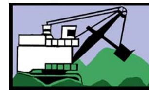
SMART Surface Mining Association for Research and Technology